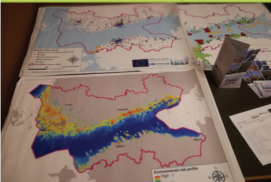
Left: Plan4Blue (01.10.2016 - 31.12.2019) supports growth of the marine and maritime sectors by planning and managing Estonian and Finnish sea areas in the Gulf of Finland and the Archipelago Sea. This requires cross-border between various stakeholders and authorities.