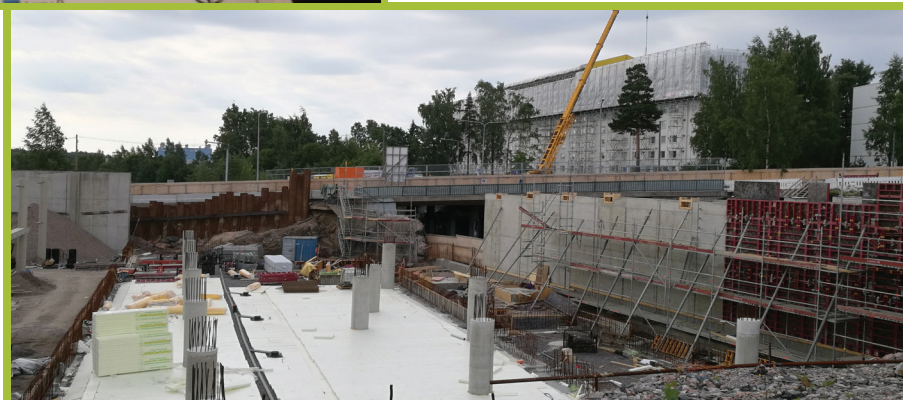
Right: project Live Baltic Campus (01.10.2015 - 31.03.2018) worked on developing campuses as innovation hubs by creating better urban environment for businesses and residents and thus contributing to new job creation in the local economy.