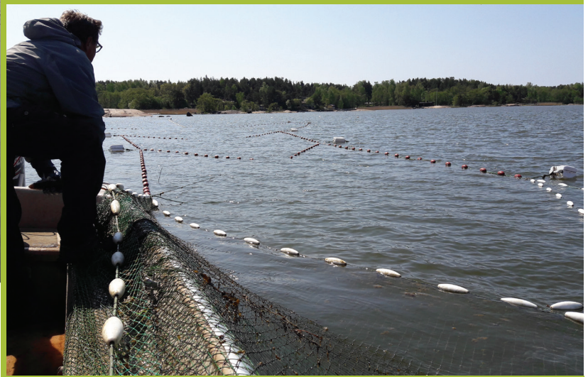
Top: NutriTrade (01.09.2015 - 28.02.2019) With targeted fishing of cyprinid fish, the project pilot Fish aims to recycle a significant amount of nutrients from the marine ecosystem.