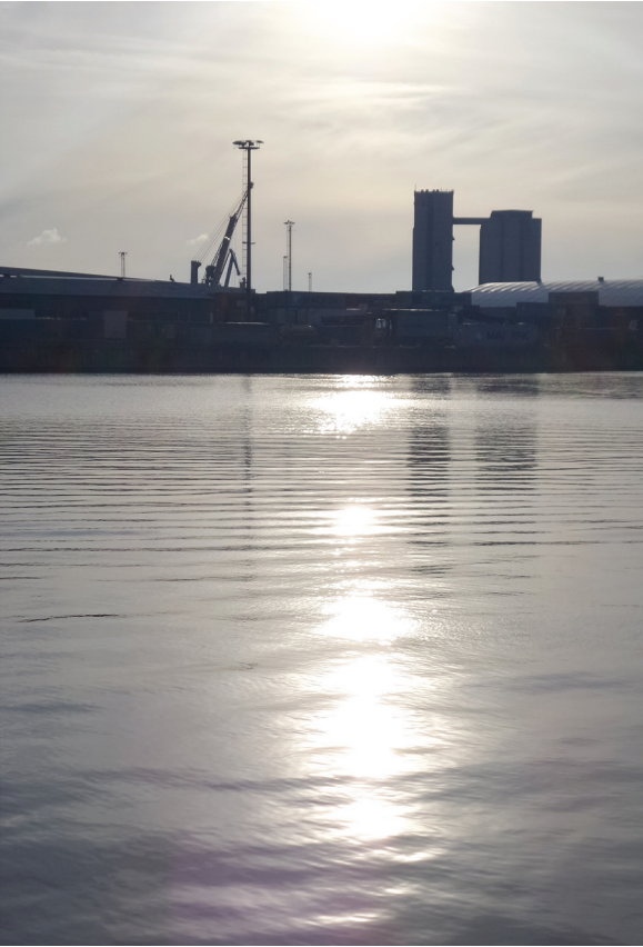
Top: the WATERCHAIN project (01.10.2015 - 30.09.2018) tackles the inflows of nutrients and hazardous substances into the Baltic Sea from all types of land-based sources