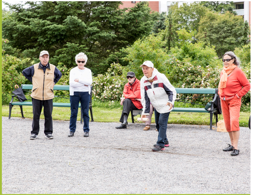
Top: thanks to our project Let Us be Active! (01.05.2015 - 28.02.2017) more than 150 elderly are now more connected to the society. The activities established in the framework of the project are still continuing.