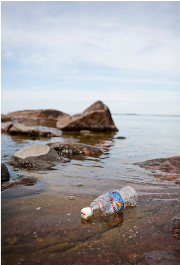
Top: The EUSBSR flagship project BLASTIC (01.01.2016 - 31.12.2018) produces methods to preventing and collecting plastic waste from the Baltic Sea.