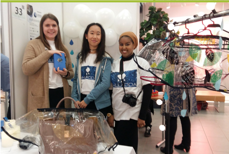
Left: within the framework of the CBEwB project (01.09.2015 - 30.04.2019), student companies have created, among others, a “real” cloud utilising LED technology, a handbag raincoat and wooden earphones.