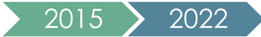
Timeline of projects

Projects from all 5 Calls of Central Baltic programme 2014-2020 are included in this package, first projects started in 2015 and the 5 th Call projects will run until 2022.